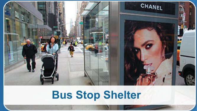
Bus Stop Shelter