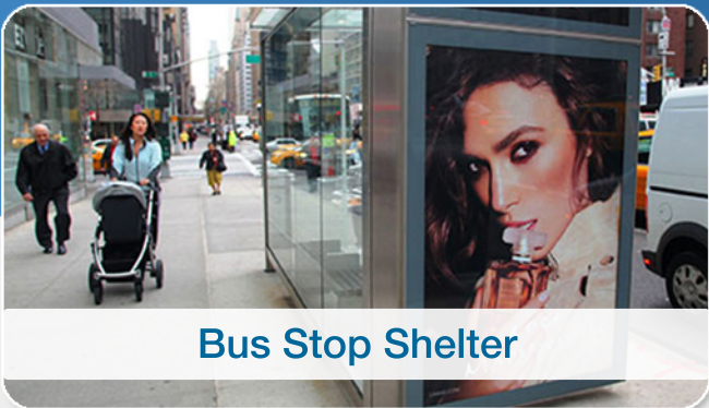
Bus Stop Shelter