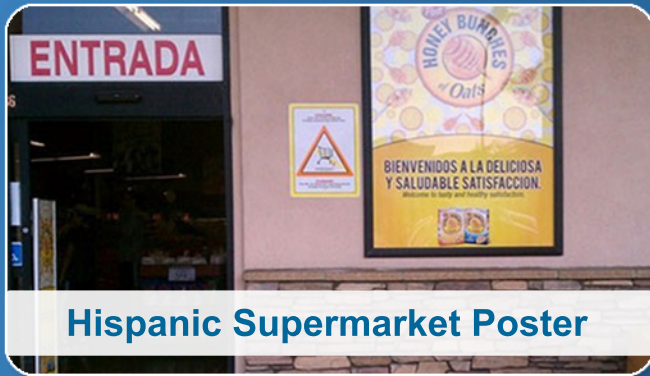
Hispanic Supermarket Poster